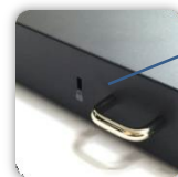
Kensington Lock &amp; U-bar Lock